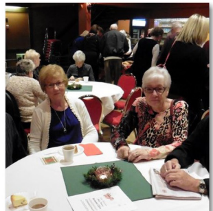
Scenes from the Christmas Bazaar